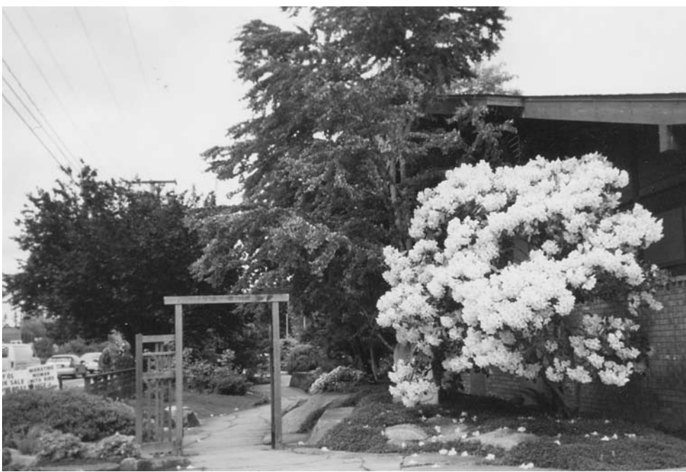
The dramatic, large rhododendron at the entrance to the Haiku Garden was already mature and saved during the 1996-97 construction of the expanded library. Today it invites visitors to pause for a while and reflect on the haiku messages and surrounding low plants within the gated area.

Honors followed quickly on the heels of completion. The American Society of Landscape Architects recognized the garden's design with a merit award. In February of 1998, the garden was awarded first prize in the national "Grow Together Garden Contest" jointly sponsored by FOLUSA and Story Publishing. More significant, however, is the ongoing recognition and appreciation exhibited by members of the community who stroll daily through the maturing garden, often accompanied by visiting friends and family.