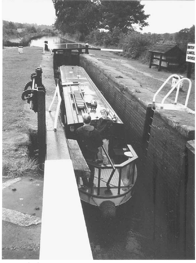
Boat in lock.