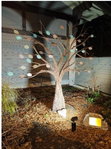
Legacy Tree honoring donors naming BPL in their estates.