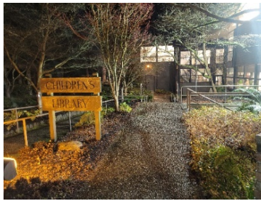
Children's Library entrance