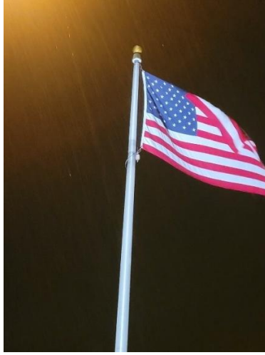
Our national flag, so it can fly 24/7