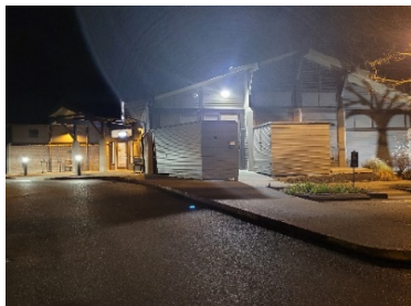
Main entry and parking lot