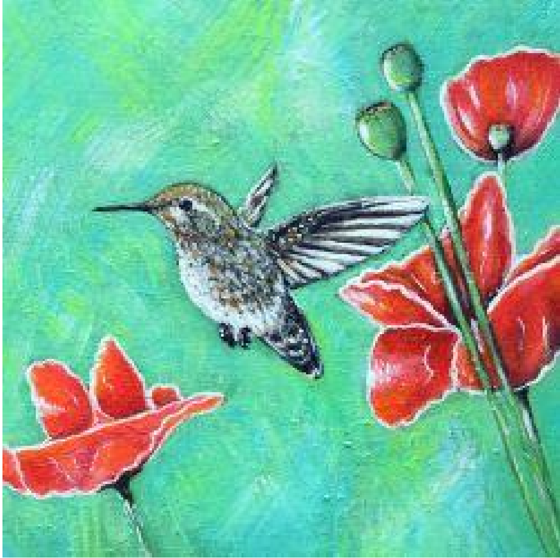
Hummingbird and Poppies - Acrylic on canvas