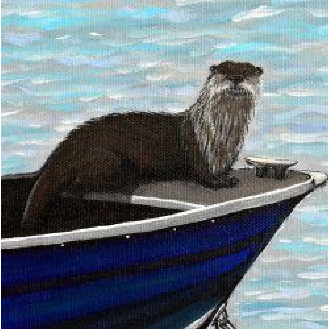
Otter on a Boat - Acrylic on canvas